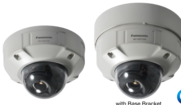
with Base Bracket