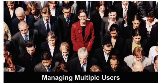
Managing Multiple Users