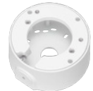
WV-QJB502A-W Mount Bracket