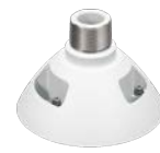
WV-QSR504M1-W Mount Bracket