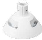
WV-QSR504-W Mount Bracket