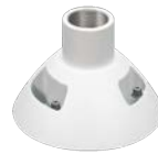
WV-QSR504F1-W Mount Bracket