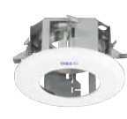
WV-QEM505-W Ceiling Mount Bracket