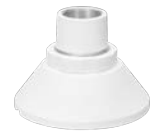
WV-QSR506F-W Mount Bracket