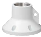
WV-QCL100-W Mount Bracket