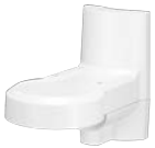
WV-QWL502-W Mount Bracket