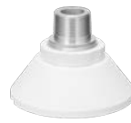
WV-QSR506M-W Mount Bracket