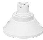
WV-QSR506-W Mount Bracket