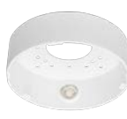
WV-QJB505-W Base Bracket