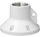
WV-QCL101-W Mount Bracket