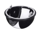
WV-QDC508C Dome Cover