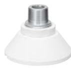
WV-QSR506M1-W Mount Bracket