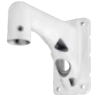
WV-QWL501-W Mount Bracket