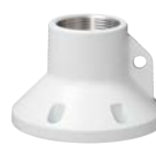
WV-QCL101-W Mount Bracket