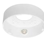
WV-QJB505-W Base Bracket