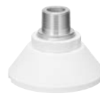
WV-QSR506M-W Mount Bracket