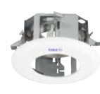
WV-QEM505-W Ceiling Mount Bracket