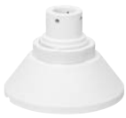
WV-QSR506-W Mount Bracket