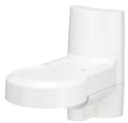
WV-QWL502-W Mount Bracket