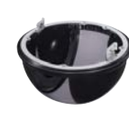
WV-QDC508G Dome Cover