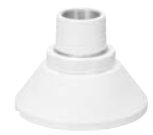
WV-QSR506F-W Mount Bracket