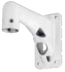
WV-QWL501S-W Wall Mount Bracket